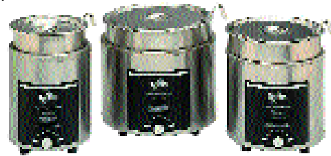
Model 4RW, 11RW & 7RW shown with optional bowl, lid and ladle

Round warmers are covered by Star's one year parts and labor warranty.